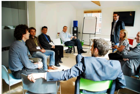
In-depth group discussion in one of the 10 individually-design breakout rooms

MEX is a very different style of conference, combining inspirational keynotes and provocations for the 100 attendees and in-depth group session for breakout teams of 10 participants