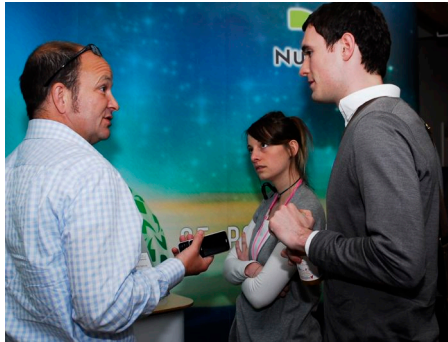
Networking at MEX