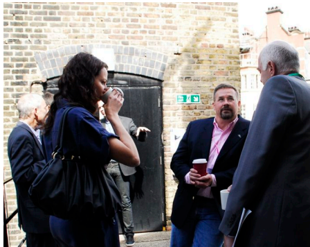
The WallaceSpace venue where MEX is hosted has a wealth of indoor, outdoor, casual and formal spaces arranged over 5 uniquely-designed floors