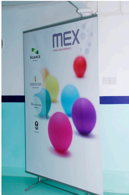
MEX venue signage for May 2009

A copy of the MEX Manifesto for May 2009. MEX is known for producing highly creative conference marketing materials, ranging from beautifully printed Manifestos on the finest papers to typographical posters.