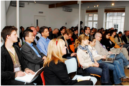
Delegates at the May 2009 MEX Conference, the 5th in the MEX series