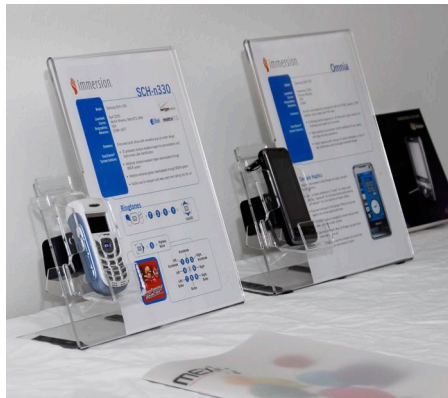
Sponsor demo station