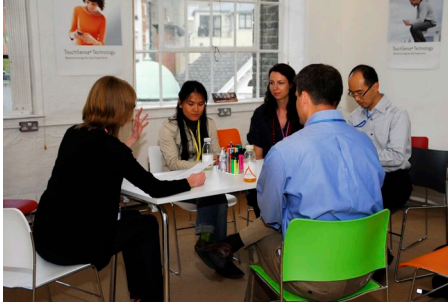
Practical exercise in one of the breakout rooms