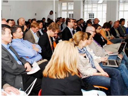
Keynote in the main conference room